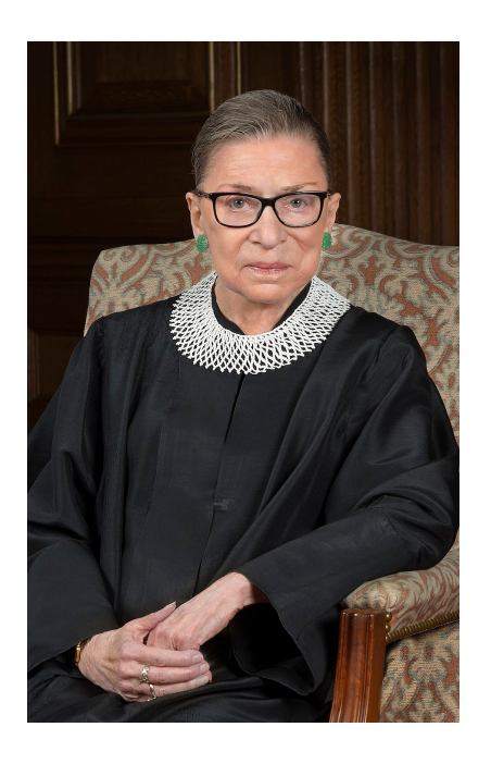
Rest in Power #RBG

Justice Ginsburg used her brilliance and determination to fight for equity in justice in our everyday lives, which had incredible impact on life and opportunities for women. She believed the constitution could evolve and reflect the times, taking on different meanings depending on when it is interpreted.