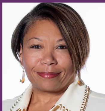
TONIT CALAWAY BorgWarner